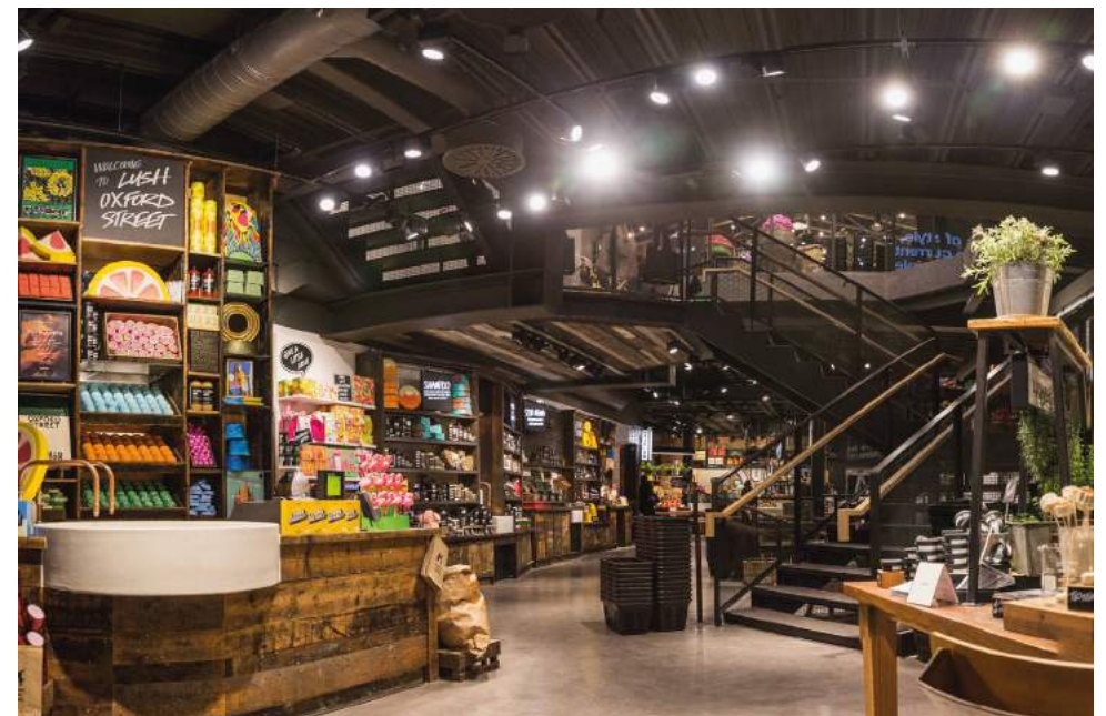
Lush Cosmetics: an international high street chain and winner of the Fair Tax Mark