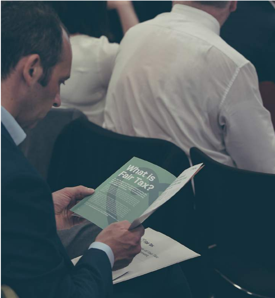
Delegate at the Fair Tax Mark's annual conference